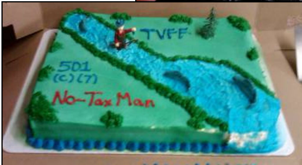
← 501 (c) (7) Fish Cake - TVFF Members Meeting October 7 th ,2010