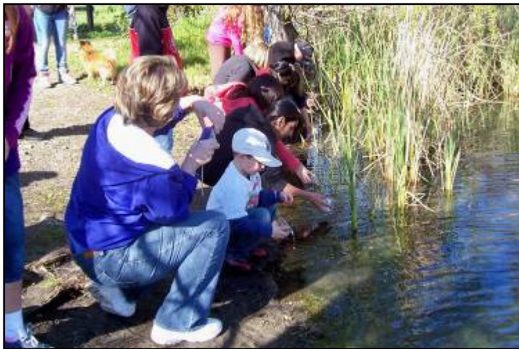
TIC –Fish Release Field Trip at Shadow Cliffs

Our “Trout In Classroom” (TIC) program is in the process of becoming activated for another season of extraordinary experiences for the students in our area. We are signing up new teachers and getting them registered to take the training they will need to participate in the program. I am making arrangements to purchase the new aquariums and related equipment to place in the new classrooms. This will be my eleventh year of working with the classroom teachers in some of our local schools. It has been a wonderful experience for me, and it has added tremendously to the recognition and respect that the community has for our organization. This is all well and good, but the real winners in this effort have been the kids. They get so much out of the program. It has proven to be an effective teaching aide and an excellent way to introduce them to some of the problems that face our fisheries. It is my hope that many of these students will, someday, develop into dedicated stewards of these fisheries, and this program is an ideal way to jump-start that development.