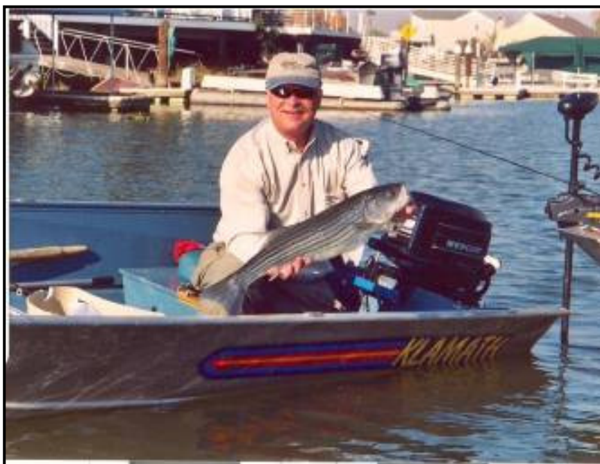
9lb. Striper from my first outing in 2006. I had never fished for stripers with a fly before and this was a great learning experience and a ton of fun.

A sign up list will be available at the November meeting.