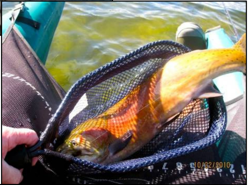
Tom Fessenden needed a bigger net to tackle this Lahontan Cutthroat at Heenan Lake. -Tom F. October 22 nd , 2010