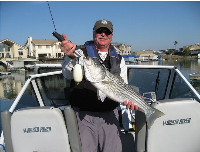
10 pound Delta striper from 2011. These fish are great fun on a fly rod.

Equipment: 8, 9 or 10 wt rod with Hi-Speed / High Density shooting heads. Lead core heads, Teeny 300, Rio Outbound or Mastery Custom Tip Express lines trimmed to match the rod all work well. The integrated style lines are easier to cast than lead core. Your leader is simply 5-6 ft of 15 - 20 lb mono (Maxima). Flies that simulate baitfish patterns such as 3-5 inch Clouser minnows, Flashtail Whistlers, Deceivers, etc. work well. The 2/0 chartreuse and white Clouser is a standard. Take a look at past newsletters for December and January of '11 and '12 for what has been successful. We will provide more information as we get closer to the outing and we can get more specific as the stripers keep move in, which usually starts around mid to late October. It is looking like a good season this year with lots of bait already arriving and being chased by hungry stripers!