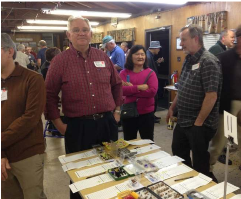
Checking out Flies, 2014 Auction