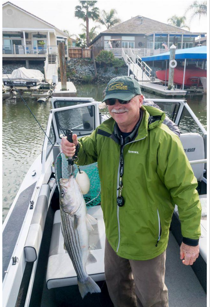
12 pound Delta striper. These fish are great fun on a fly rod.

We will provide more information as we get closer to the outing and we can get more specific as the stripers keep moving in, which usually starts around mid to late September. It is looking like a good season this year with lots of stripers being caught out in the ocean and bay!