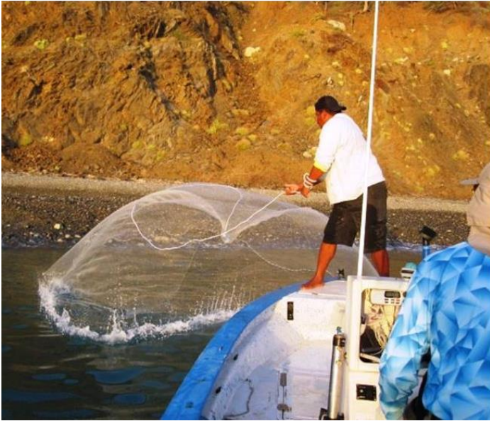
Catching the Bait