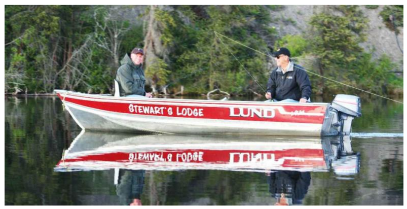
The lodge provides 12 to 14 foot boats with 3hp to 8hp motors.