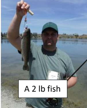
All with some very happy veterans, some of who never caught a fish with a fly rod before!