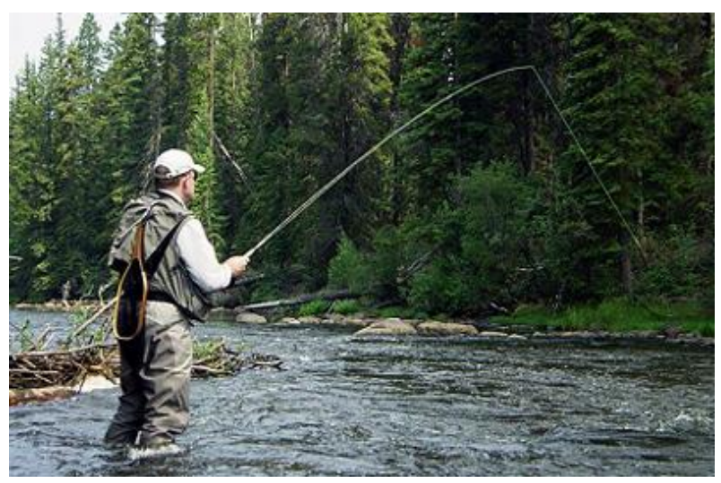
Fish cleaning, smoking and vacuum packing services available.