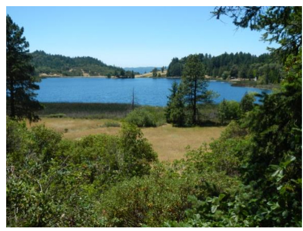
Private lake full of BIG BASS.

Since 2014 we have helped the BSA put on a Fly Fishing Merit Badge program at their Wente Scout Reservation Summer Camp located in Willits, CA.