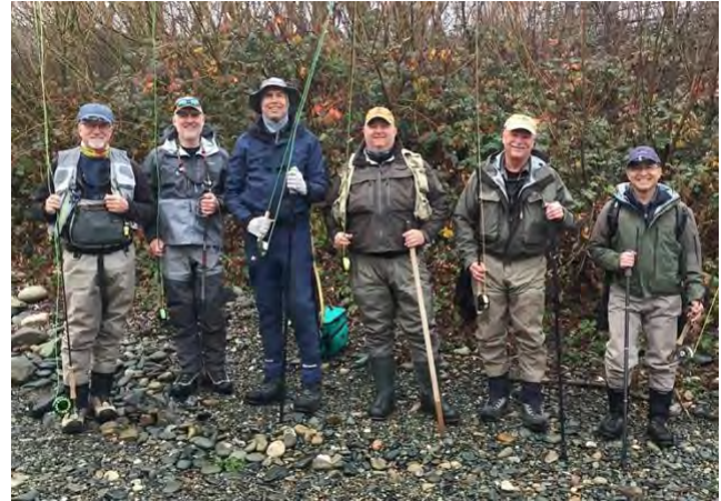
A motley crew enjoying a day hunting steelhead on the Feather River.